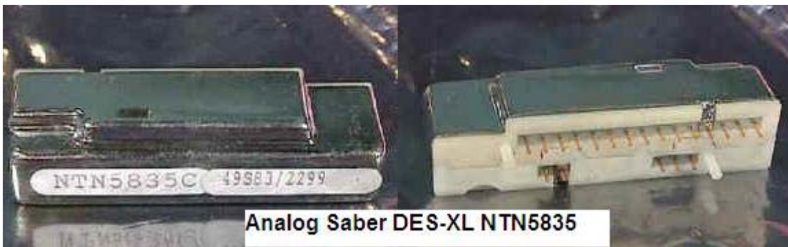
Analog Saber DES-XL NTN5835