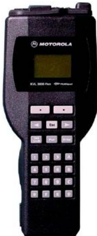
KVL 3000 Plus