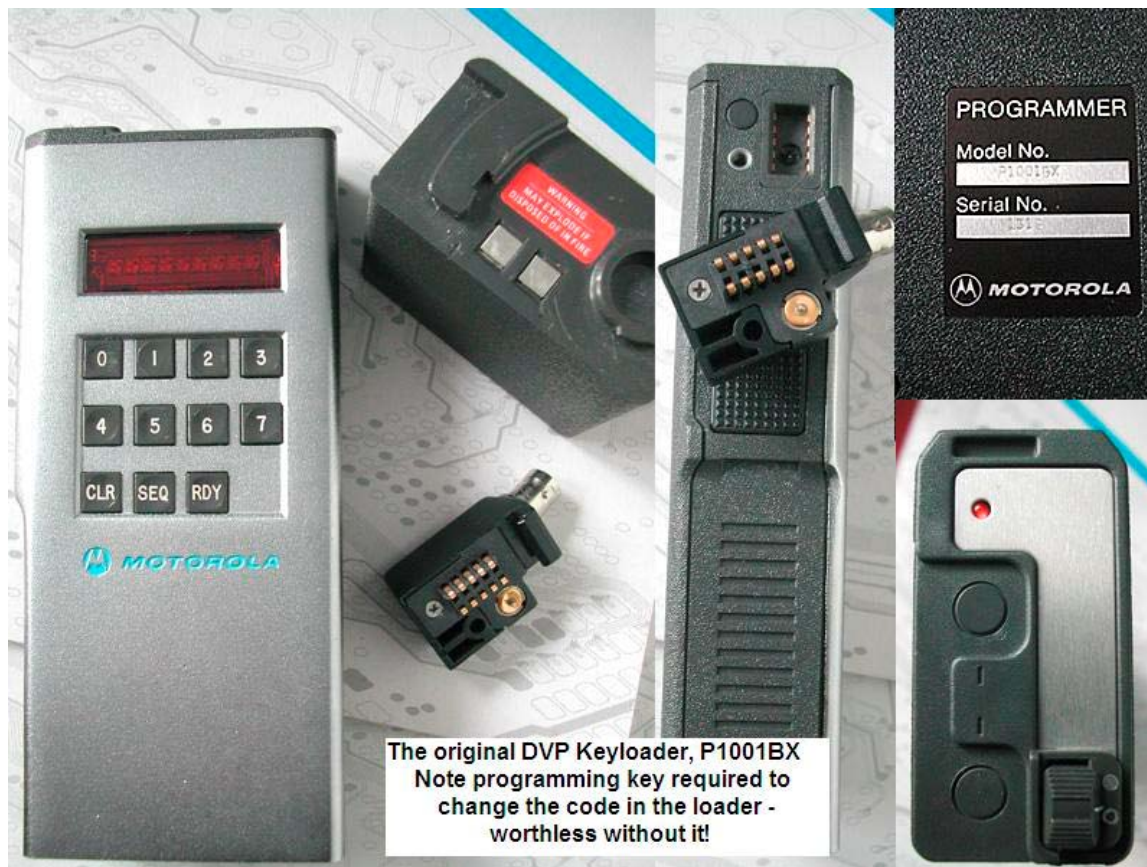
The original DVP Keyloader, P1001BX Note programming key required to change the code in the loader - worthless without it!