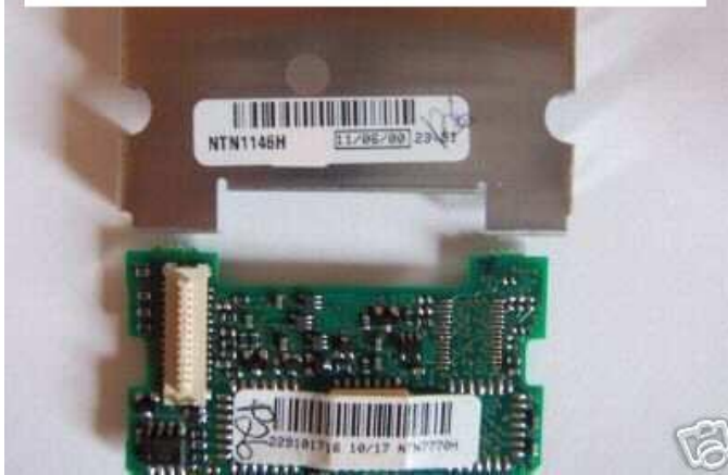
NTN1146 / NTN7770 Astro Saber DVP Module