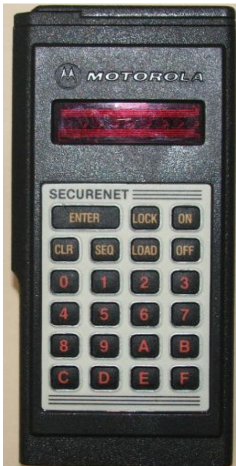
T3014DX DVP-XL Keyloader