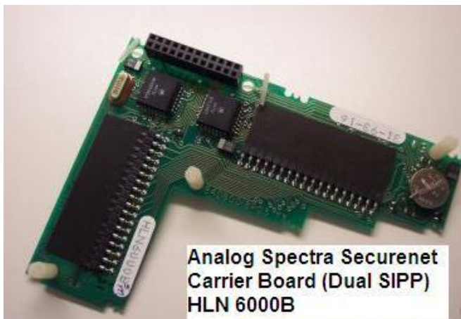
Analog Spectra Securenet Carrier Board (Dual SIPP) HLN 6000B