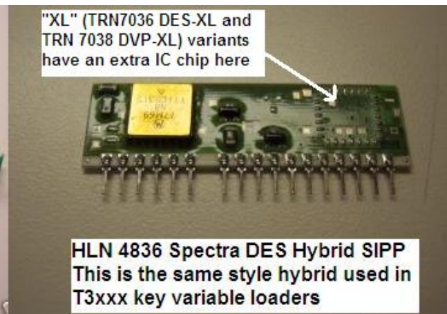
"XL" (TRN7036 DES-XL and TRN 7038 DVP-XL) variants have an extra IC chip here