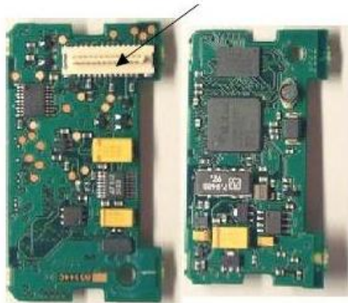
Astro Saber / Astro Spectra UCM (Typical)