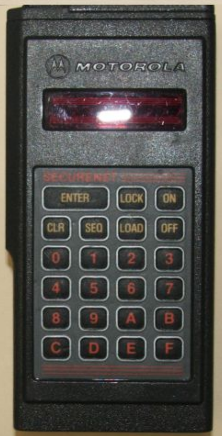
T3012DX "Supervisor" DVI-XL